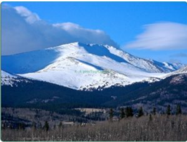
14- "Miserly-sunlight-awaits-us-constantly-however" (17.5"W-x-13"H)