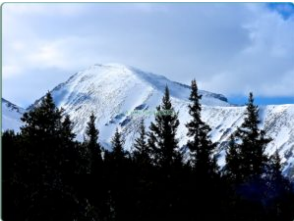
11- “Doing-youRself-justice-not-to-oR-climb” (17.5”W-x-13”H)