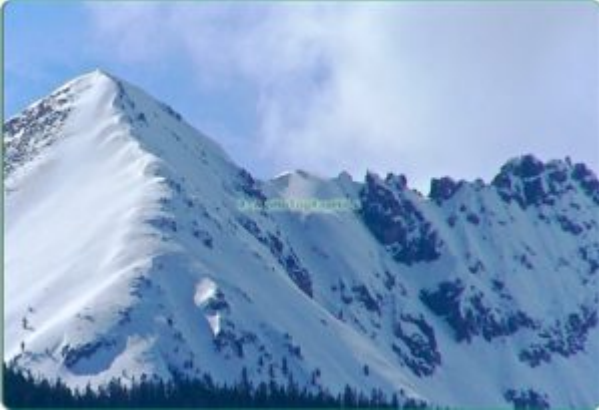
9- cRop-cRop-cRop “cRiticalclimb-angle-take-the-windiest-approach-a-ridge-oR-look-fromafaR-to-closeR” (17.5”W-x-13”H)