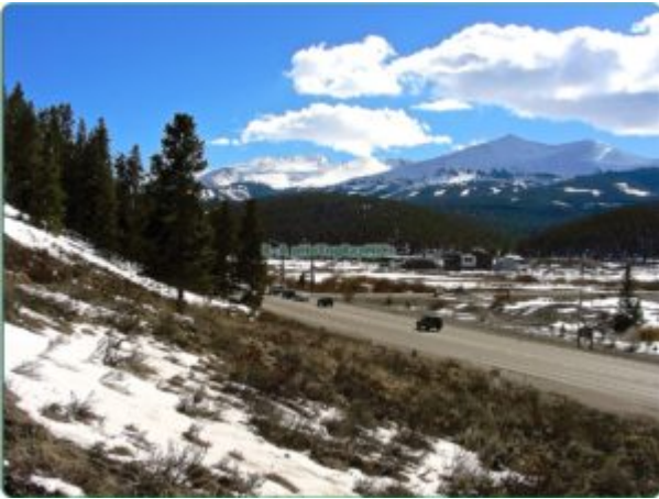
4- "Not-moving-beyond-the-issues-of-R-0-N-G-phooel-automotive- highways-clutter-w-C0-2s-high" (17.5"W-x-13"H)