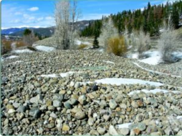
3- "The-dRedge-mounds-of-1910-already-pounded-by-2009" (17.5"W-x-13"H)