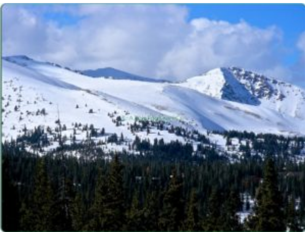
10- “Ohh-sweet-mellow-n-cold-mTN...” (17.5”W-x-13”H)