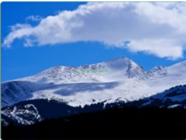
5- "Estrangement-mTN-nearR-township-bReckenridge-C0" (17.5"W- x-13"H)