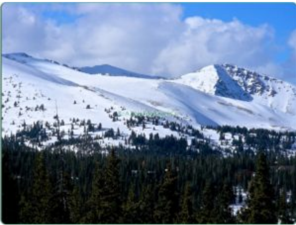
10- “Ohh-sweet-mellow-n-cold-mTN...” (17.5”W-x-13”H)