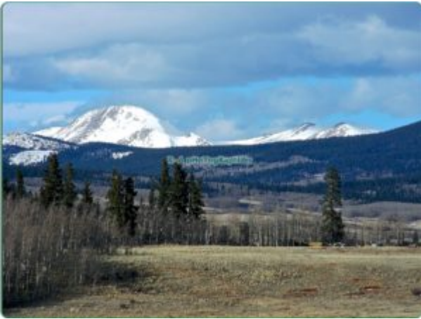
13- "Climbing-ridges-to-get-into-hard-gRanite-peaks-climbinGs.." (17.5"W-x-13"H)